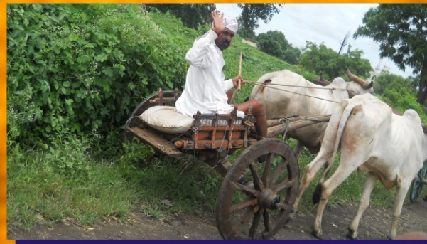
A Pilgrim from village Nillod, Aurangabad

Dr. Babasaheb Ambedkar Marathwada University, Aurangabad